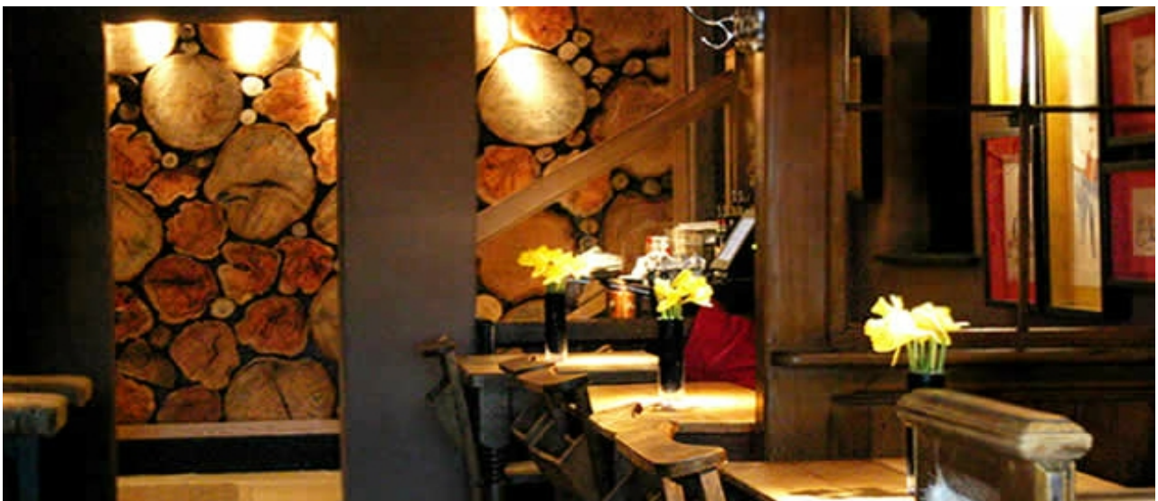
A beautiful English gastro-pub

** All inclusive £1000 (standard accomodation) –£1200 (suite accomodation) per day